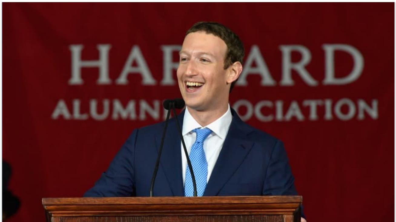
Facebook's Mark Zuckerberg delivers an address at Harvard's 366th commencement exercises on May 25, 2017 in Cambridge, Massachusetts.